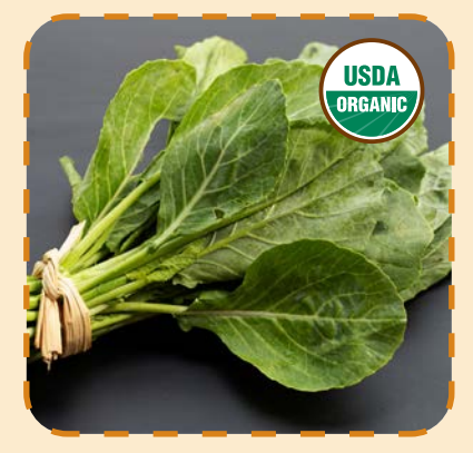
2 FOR $5