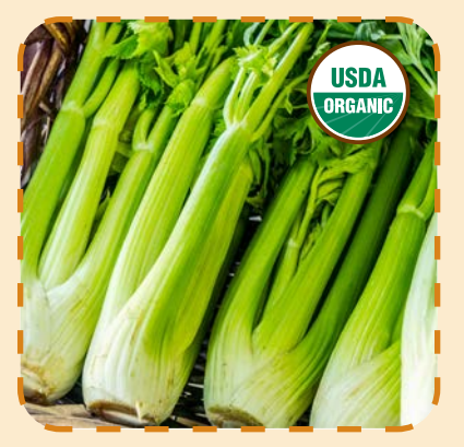
2 FOR $5