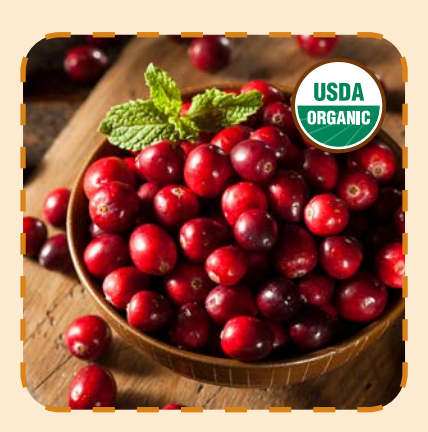
2 FOR $7