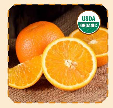
4 FOR $5